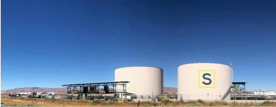
Sulfuric acid tank terminal in Nevada, USA